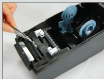
Reflective sensor (Black Mark Sensor)