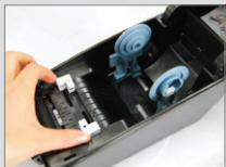
Transmissive sensor (Gap, Media sensor)